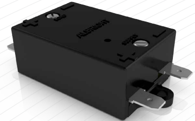
CC74 Automatic Coil Economiser Module

The CC74 module is available in two universal types covering voltages from 12V to 60V and 60V to 125V, where the final output voltage is a fixed ratio of the input voltage. Versions are also available that have a fixed, regulated output voltage. These regulated devices provide the optimum coil voltage without the need for any pre-regulation and can offer the opportunity for customers to use a single type of contactor with different supply voltage systems. For further information refer to the CC74 Catalogue Data Sheet available on our web site or contact our Technical Department.