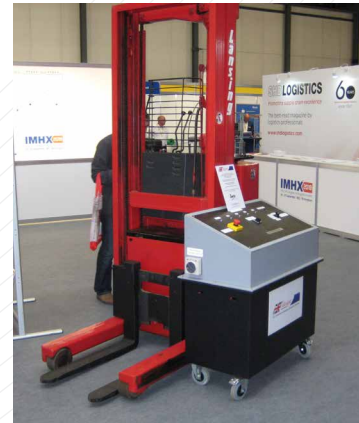
Portable Power Pack with Fork Lift Truck

Referencing the solution Rob states "it is universal to any truck on the site. The driver simply selects the right voltage and plugs the power pack into the truck." Adding "We are pleased to be able to support the National Fork Truck Heritage Centre with the help of Strongs and EnerSys, as well as Albright Contactors".