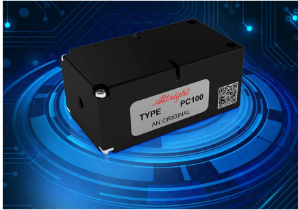
The New PC100 miniature PCB Mountable Contactor

The PC100 is the latest addition to our established miniature PCB mountable series of contactors. Offering a high thermal current capability, it is rated at 100 amperes with a single pole, single throw configuration.