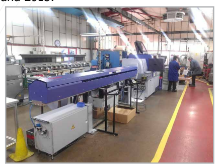
Machining section - Whitchurch, UK

All of these investment developments will ensure that Albright continue to deliver high quality, reliable and innovative contactors to our customers and will result in a reduction in our lead times so that we can supply our customers even faster with their Albright products. This investment in manufacturing is just part of what Albright has planned for 2014 and 2015.