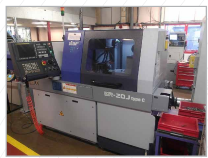
New CNC machine

As a progressive, customer focused company, Albright is continuously looking to improve to the benefit of our customers. A focus for 2014 is our European manufacturing facilities, which includes investment in the UK with 3 new CNC machines. These machines will not only increase our capacity, but more importantly provide state of the art CNC capability. Additionally, we have designed and manufactured in-house