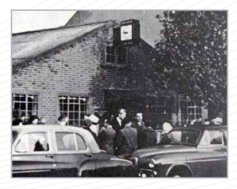
Albright Surbiton, c.1950

Albright was founded with our Surbiton site in 1946, where we began manufacturing specialist switchgear to our customer's branching design: out to manufacture our established Albright Contactor Range in 1955.For 40 years, Albright operated solely from our Surbiton site, forging a reputation for