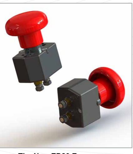
The New ED80 Emergency Disconnect Switch

For further information on the ED80, contact technical at technical@albrightinternational. com or refer to our catalogue sheet, when available, from the Downloads section of our website.