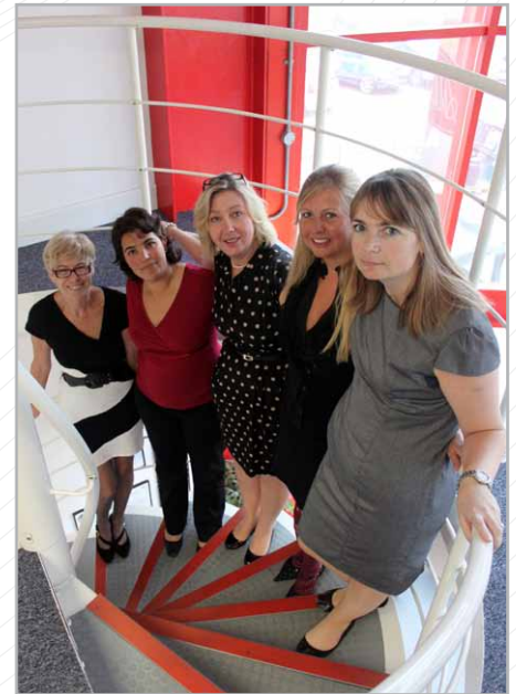
The UK Sales Team

All agree they enjoy their challenging roles, bringing enthusiasm and professionalism to their responsibilities. Collectively, our team has experience in sales, marketing, purchasing and management. Our Sales team can be contacted directly via phone: +44 (0)1256 890030, fax: +44 (0)1256 890043 or email sales@albrightinternational.com and will be eager to assist you with any of your sales activity enquiries.