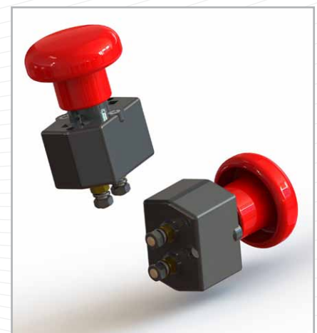
The New ED80 Emergency Disconnect Switch