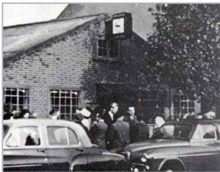
Albright Surbiton, c.1950

Albright was founded with our Surbiton site in 1946, where we began manufacturing specialist switchgear to our customer's design; branching out to manufacture our established Albright Contactor Range in 1955. For 40 years, Albright operated solely from our Surbiton site, forging a reputation for