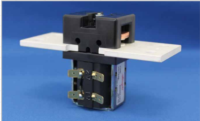
The SW300 (with optional Silver plated contacts)

Albright International introduces the SW300 range, another new and innovative contactor to add to our expanding