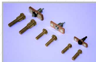
Albright Contacts and hardware

Spares information can be obtained from the download section of the web site or by contacting your local agent or Albright directly.