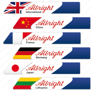
The new Albright Logos

On release, the new versions of the catalogues will be readily available to download from our internet site and will be available through your local agent or by contacting Albright International (for contact details please refer to page 4 ).