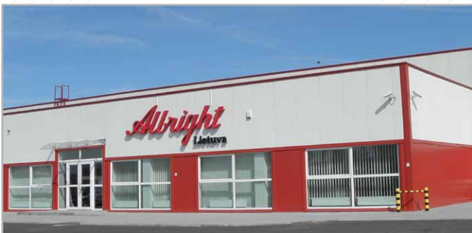
Albright Lietuva in Klaipeda, Lithuania

The addition of this factory, along with our facilities in the UK and China confirms the position of Albright International as the leader in low voltage D.C. contactors in the industries we serve. As with all our established companies, Albright Lietuva has implemented the Albright International principles of quality and high standards ensuring our original designed products maintain their prominent status on the market.