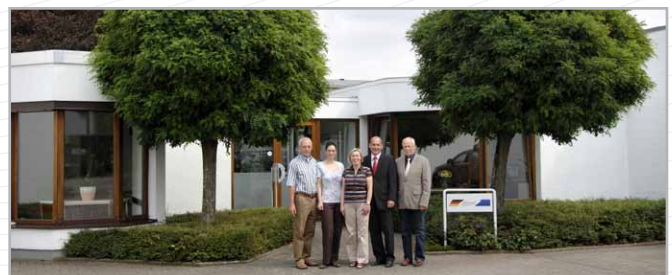
Albright Deutschland Team in Bremen, Germany

tel (+49) 0421 8060730 fax (+49) 0421 80607319 email info@albright-deutschland.de