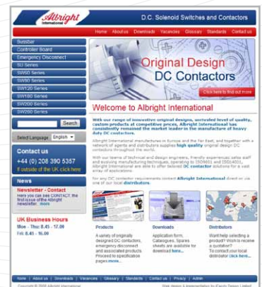
The Albright Internet Home Page

In addition, to keep up to date with any other Albright International related news please refer to the News section of our web site which is located on our home page at www.albrightinternational.com