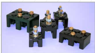
Albright Top Cover Assemblies

In addition to offering complete contactors and emergency disconnect switches, Albright International offers genuine spare parts for a range of our products.